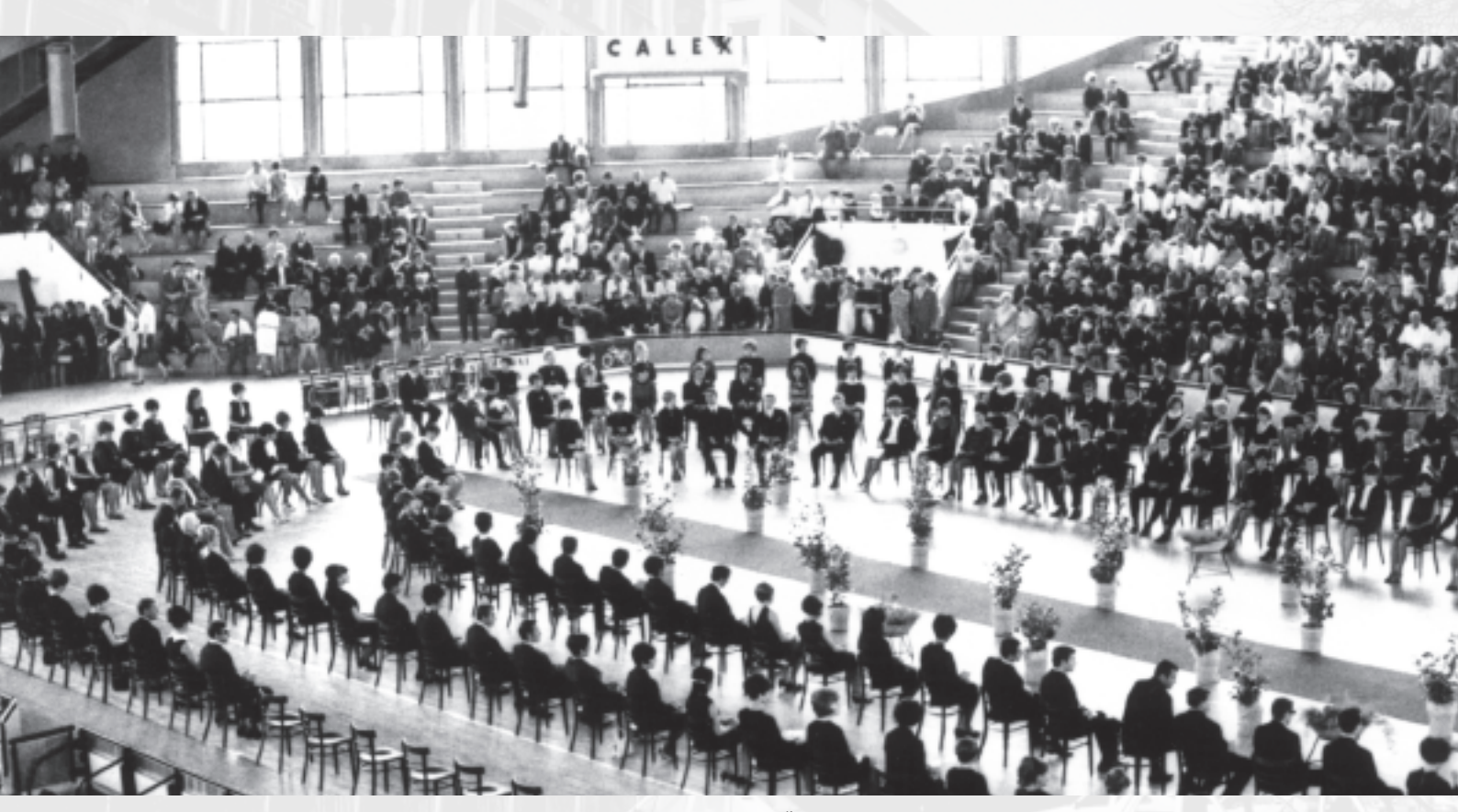
The graduation ceremony for the year 1972 in the Športová hala Pasienky in Bratislava.